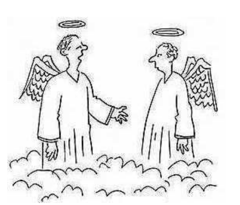
I would have been here sooner if I hadn't had such a wonderful caring nurse looking after me!

(patient looked a bit perplexed) "Ok.Uhmm. I have a question." "Oh, what's your question." "Well, I hope you don't mind me asking, but, I was just wondering ... why Pepsi and not Coke?"